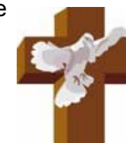
Saint Katherine Drexel

"The patient and humble endurance of the cross, whatever nature it may be, is the highest work we have to do."