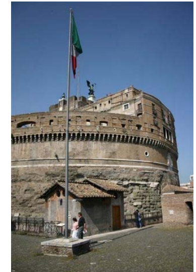
Castel Sant'Angelo In Rome