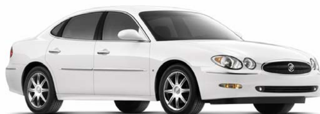
Automobile courtesy of Patsy Lou Williamson

2006 Buick LaCrosse 4 Door Air Powered Lumbar 6-Passenger Seating 2800 V6 Engine 16" Aluminum Wheels