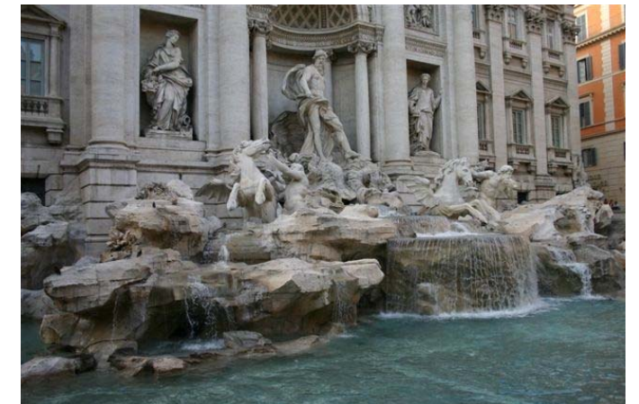
Fontaine of Trevi - Rome