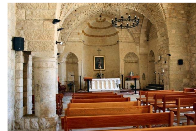
Saydet El-Talleh Deir El Qamar - Lebanon (Picture taken in May 2006)