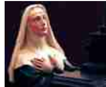
St. Rita of Cascia Feastday May 22

Our Lady of Lebanon Reception Hall 4133 Calkins Road Flint Michigan 48532