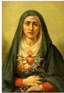
Our Lady of Sorrows

Hanatal@aol.com http://flawlessfaces.myrandf.com http://flawlessfaces.myrandf.biz