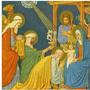
Epiphany of Our Lord

Hanatal@aol.com http://flawlessfaces.myrand.com http://flawlessfaces.myrandf.biz